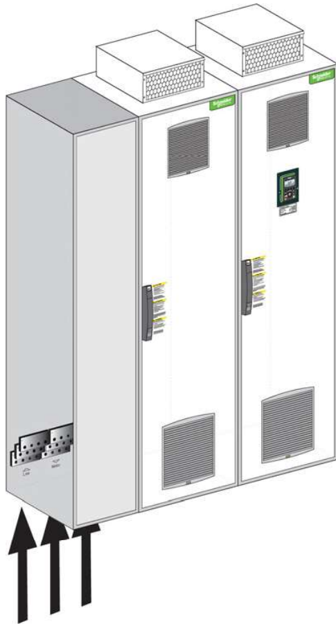
Additional enclosure allowing cabling from the bottom